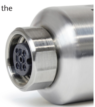
Closeup of the M12 Connector